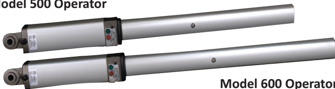
Model 600 Operator