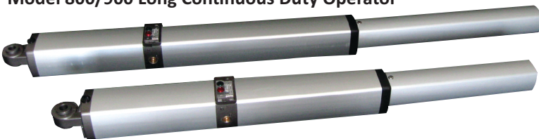
Model 800/900 Continuous Duty Operator