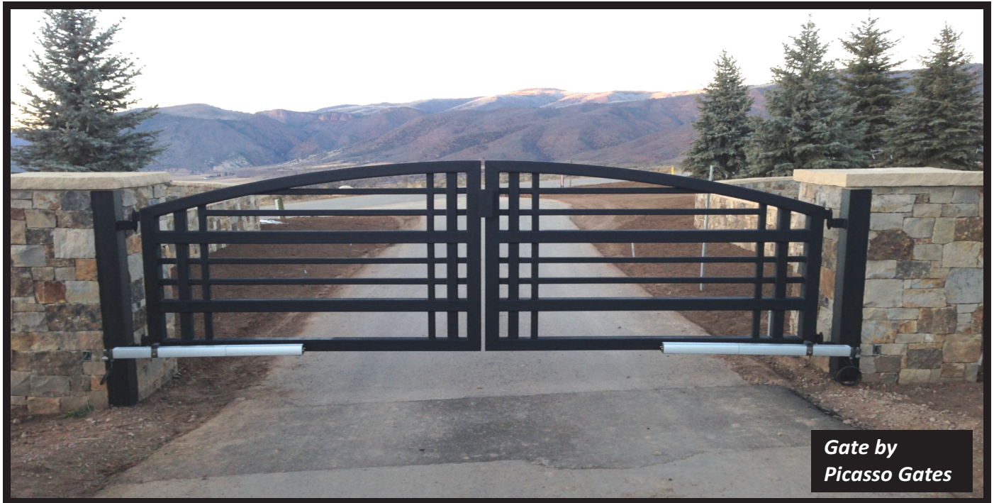
Model 500 Operator

SECURITY • SAFETY • RELIABILITY • ENDURANCE